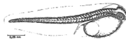
f) Larva 3 hours 30 minutes after hatching