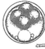
b) Egg with 4 blastomeres