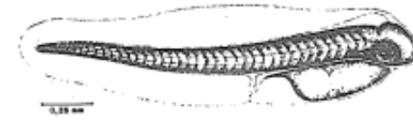
g) Larva 11 hours 30 minutes after hatching