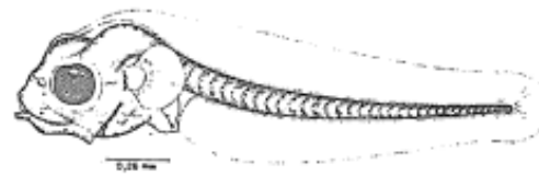
k) Larva 4 days after hatching