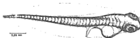
h) Larva 21 hours after hatching