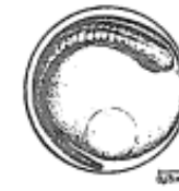
d) Embryo 13 hours after fertilization