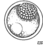
c) Early blastula stage