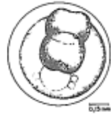
a) Egg with 2 blastomeres