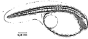
e) Larva just after hatching